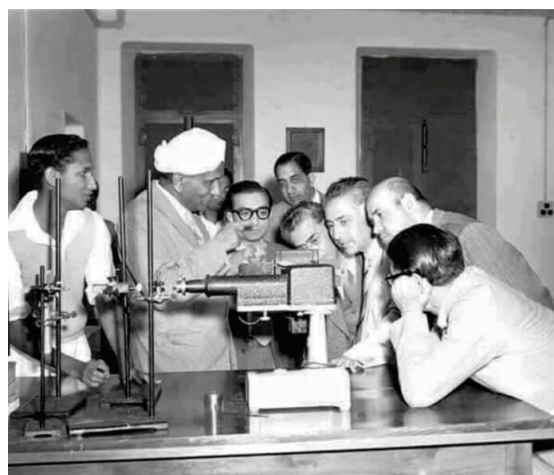
Sir CV Raman Explaining Raman Effect

Once during his return from Europe, Raman was amazed by the blue color of the sea. He did some experiments and during this voyage, Raman sent two papers to the journal Nature stating that the color of the sea was due to light scattering by the water molecules - a phenomenon he called molecular diffraction. Raman showed that the blue color of the sea is due to molecular scattering and not due to reflection of the color of the sky. Back home in India, Raman and his students studied the frequency shift of scattered light. The real discovery of the "Raman Effect" took place on the 28th of February 1928 when he pointed a direct vision spectroscope on the scattered track and observed that the scattered light contained not only the incident color but at least one other which was a clear demonstration of change in wavelength due to scattering. His research on "Raman Effect" was awarded the Nobel Prize by the Swedish Academy of Sciences in 1930. The Government of India honored him with Bharat Ratna award in 1954. He was also awarded Lenin Peace Prize in 1958. He believed that his life was reserved for science.